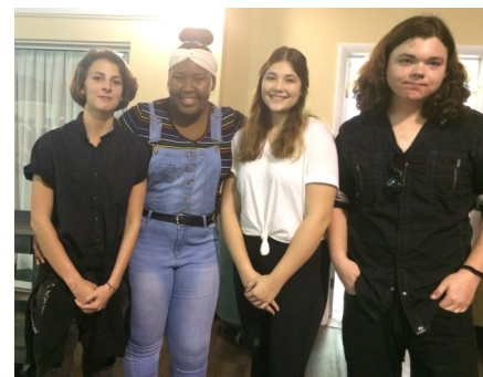
Above are the Culinary Arts Program students from Arnold High School, who helped to make dining at the Beach Boogie Dance more enjoyable for all who attended. They did a very efficient job.