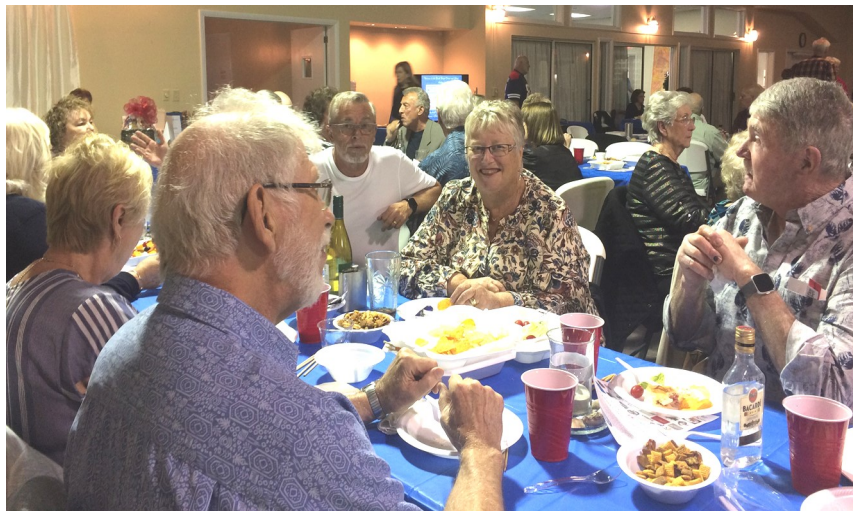
Seen above are patrons enjoying the refreshments served by students from the Culinary Arts Program at Arnold High School. A menu of the various courses on each table helped everyone know what delicious items were in store for them, listing everything from appetizers to desserts.