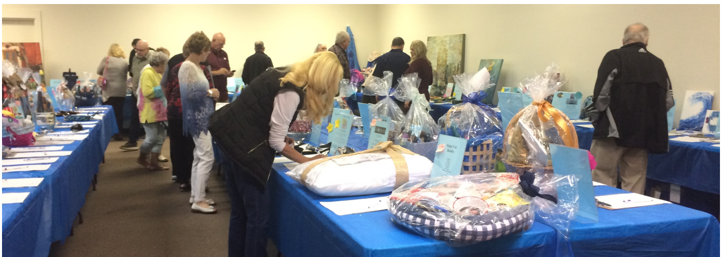
The bidding room for the Silent Auction was a huge attraction for many. There was a wonderful selection from which to choose, and many went home with their treasures and smiles on their faces.